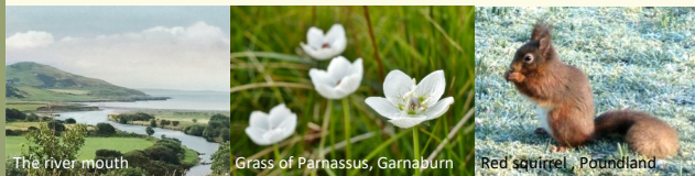
The river mouth

The valley of the Stinchar, one of the most beautiful and tranquil in southern Scotland, lies in south Carrick, part of the Galloway and Southern Ayrshire Biosphere. Rising in the Galloway Forest, the river flows through the villages of Barr, Pinwherry and Colmonell, reaching the sea at Ballantrae. There are many old oak woodlands, rich in plant life. The distinctive hill of Knockdolian, an ancient volcanic plug, rises at the lower end of the valley — a landmark for miles around.