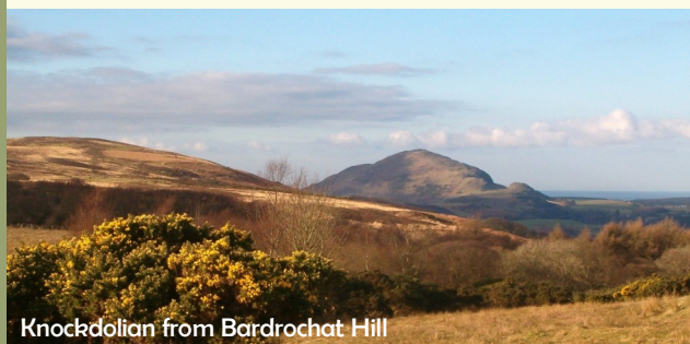
Knockdolian from Bardrochat Hill

There is a wide variety of fauna and flora in the valley, including roe deer, red squirrels, hares, badgers, otters, herons, oyster catchers, dippers, greater spotted woodpeckers, tawny & barn owls, bluebells, tansy, ramsons, cranesbills and water avens. Red deer, curlew, skylarks, golden plovers, heath spotted orchids, rock roses and grass of Parnassus are to be found in the surrounding hills.