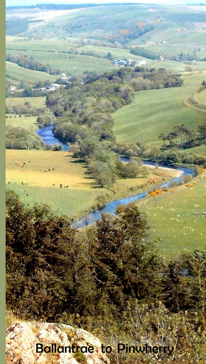
Ballantrae to Pinwherry