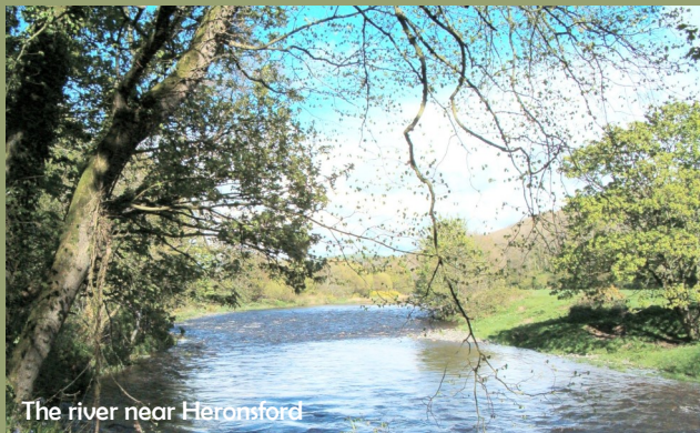
The river near Heronsford

The valley of the Stinchar, one of the most beautiful and tranquil in southern Scotland, lies in south Carrick, part of the Galloway and Southern Ayrshire Biosphere. Rising in the Galloway Forest, the river flows through the villages of Barr, Pinwherry and Colmonell, reaching the sea at Ballantrae. There are many old oak woodlands, rich in plant life. The distinctive hill of Knockdolian, an ancient volcanic plug, rises at the lower end of the valley — a landmark for miles around.