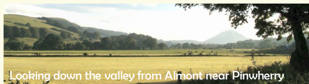
Looking down the valley from Almont near Pinwherry

Take special care to follow the Scottish Outdoor Access Code: www.outdooraccess-scotland.scot . Take responsibility for your own actions, be aware that this is a working landscape, respect the interests of other people, and take care of the environment. Please do not disturb grazing animals, wildlife, game, or growing crops, keep dogs under strict control, and pick up after them. Do not take dogs into lambing fields or fields with calves. Keep to paths where possible, shut any gates you have to open, light no fires and leave no litter behind you. Be aware that stock may not always be visible when first entering a field. Note - most of the walks with stiles not suitable for dogs.